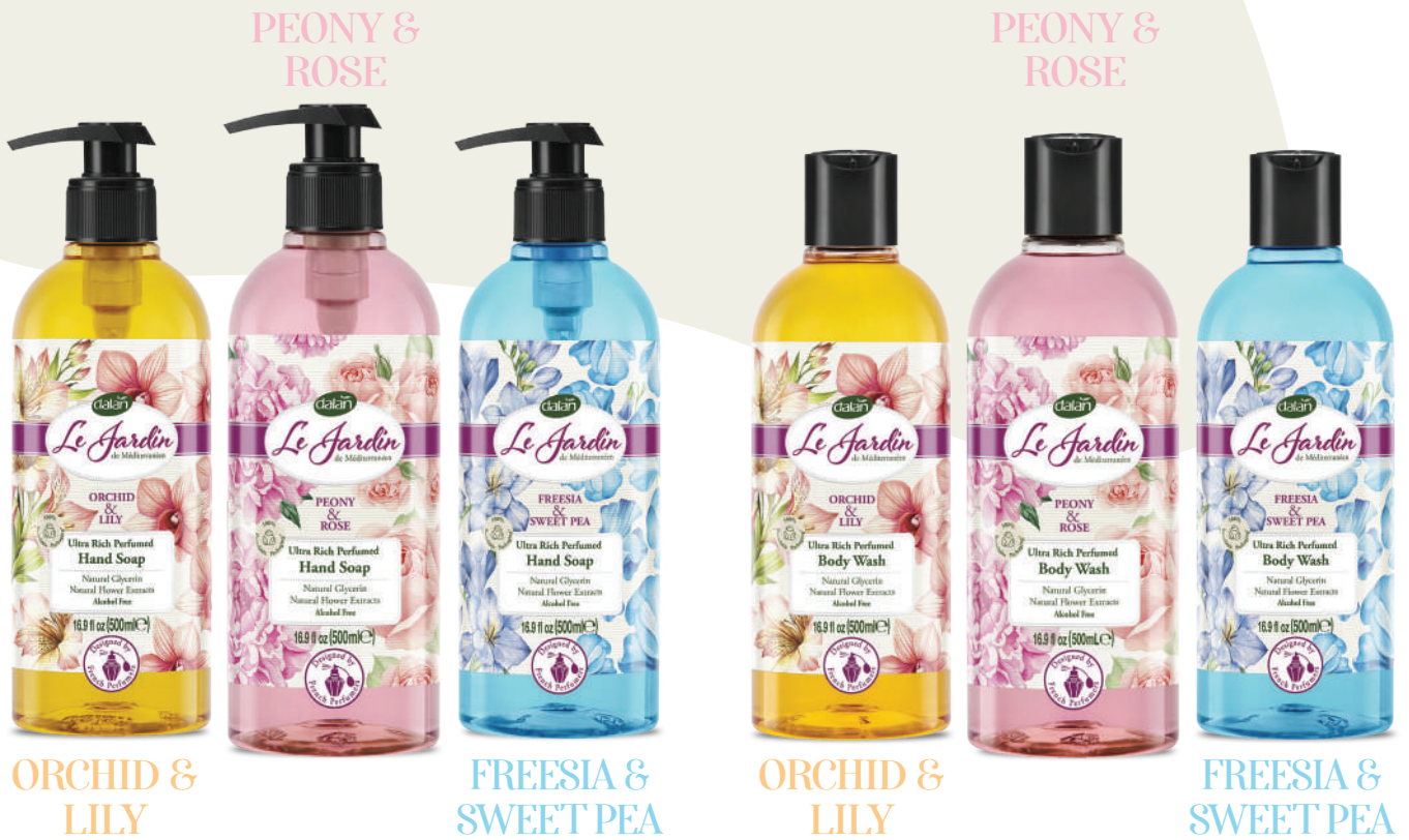
ORCHID & LILY