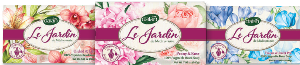
FREESIA & SWEET PEA