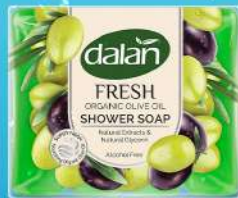
ORGANIC OLIVE OIL