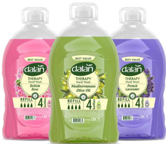
ROSE OLIVE OIL LAVENDER